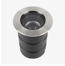
PVC Recessed box included