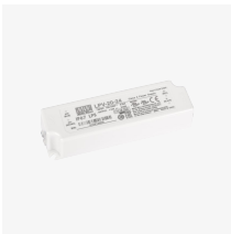
Power supply ON-OFF IP67 0-20W 24V 100-240V Ref. 4.2042.1501