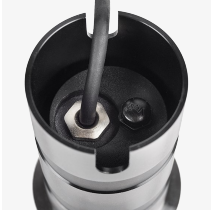
Pressure equalize valve