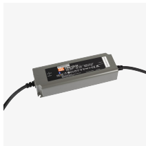
Dim Power supply Casambi IP67 0-120W 24V 90-305V Ref. 4.9101.5002